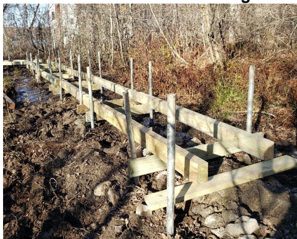
Boardwalk Structure In Progress