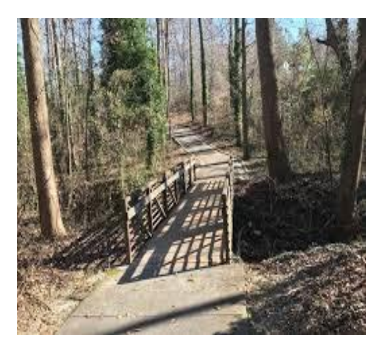
UA bridge and boardwalk examples