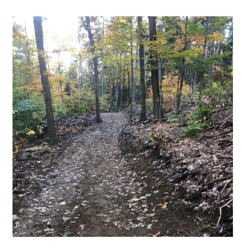
3 Foot Wide Firm & Stable Surface with Gradual Grades