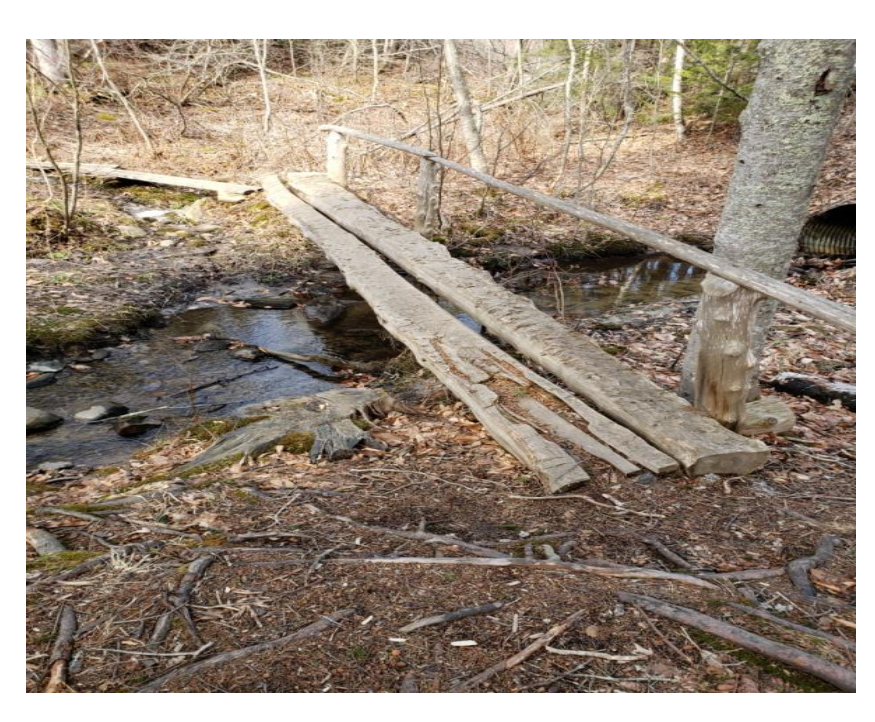
Existing bridge – safety concerns