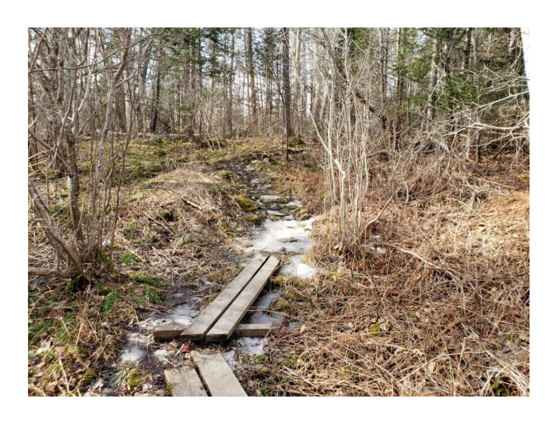
Steep grades – slippery when wet