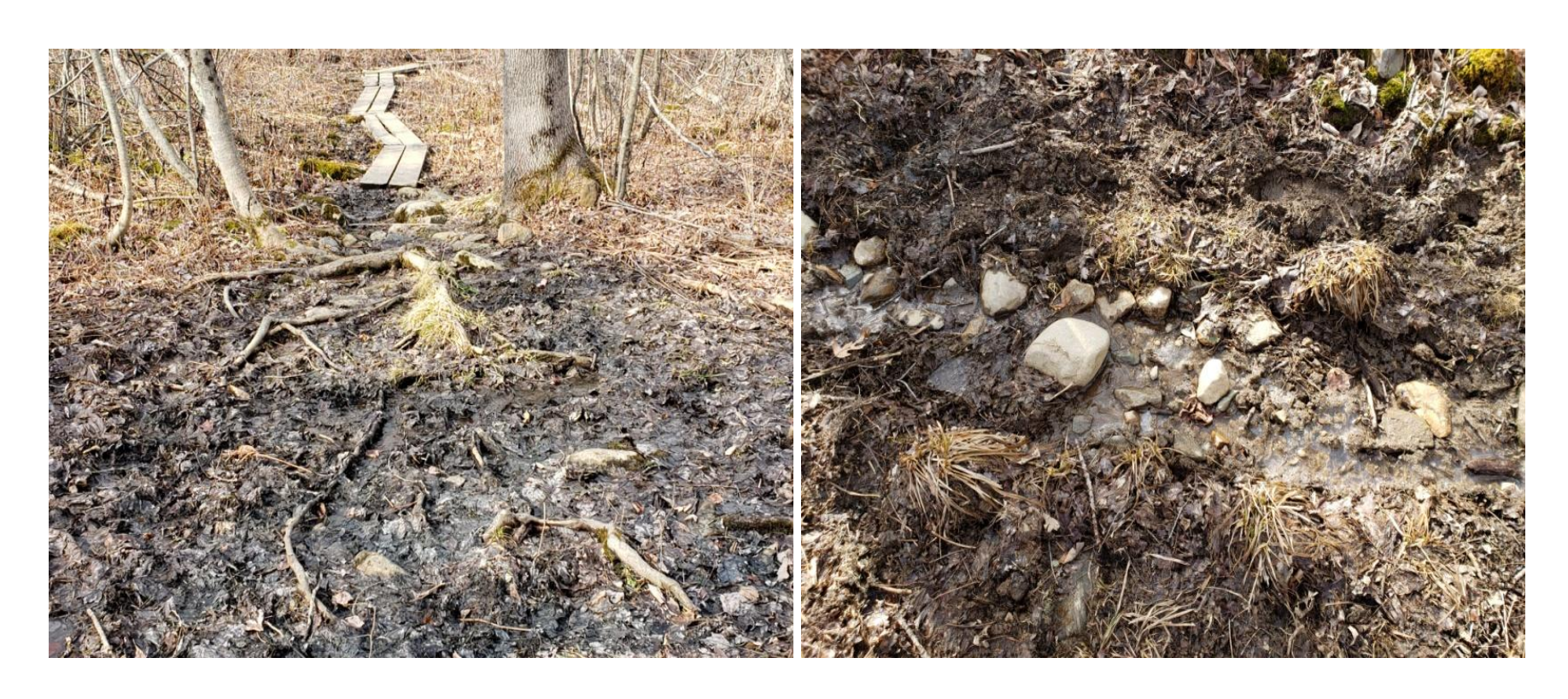
Trail deterioration – widening and erosion