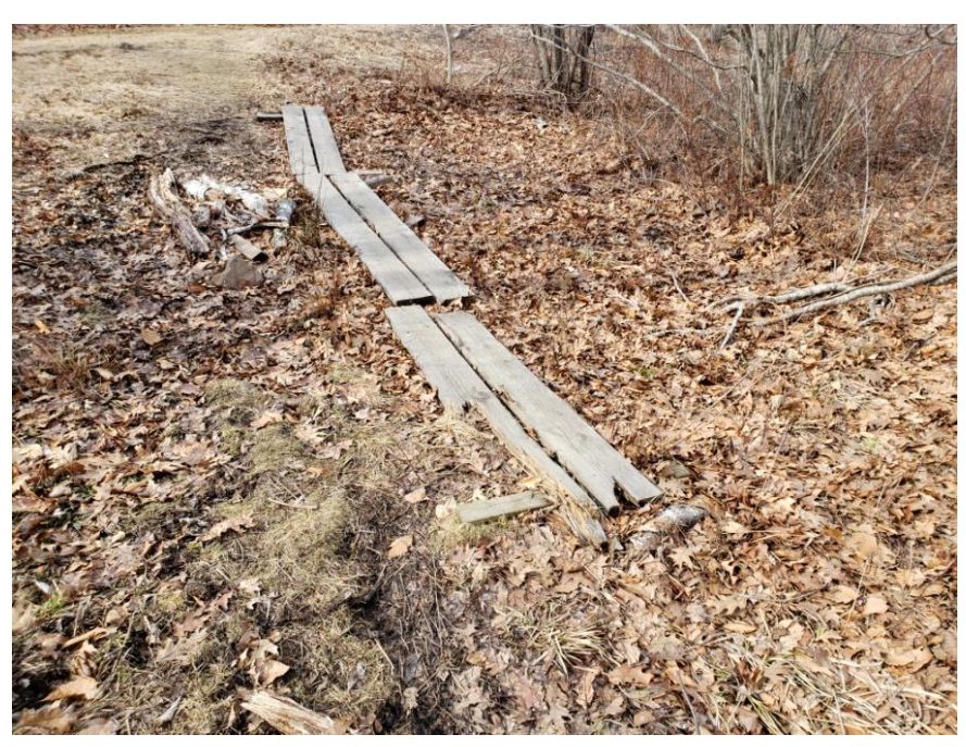
Bog bridging – constant repair required